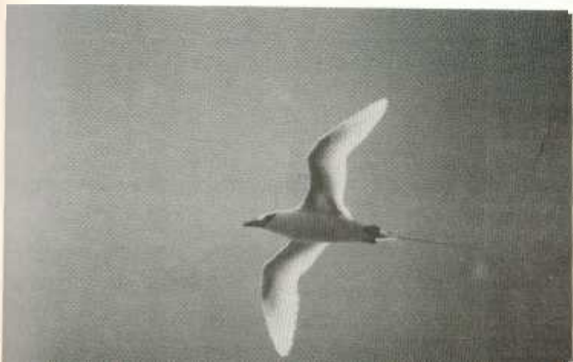
Red-tailed Tropicbird Paethon rubricauda photographed at Cape Clear, Lord Howe Island on 5th March, 1985.