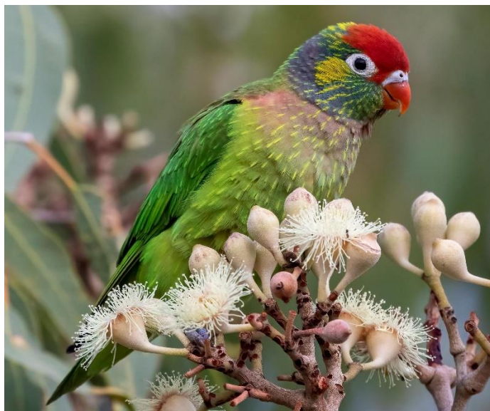
Varied Lorikeet