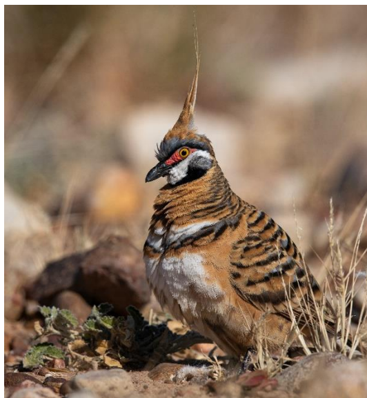
Spinifex Pigeon (Jon Norling)