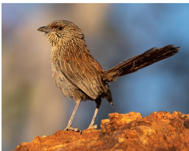
Kalkadoon Grasswren (Jon Norling)