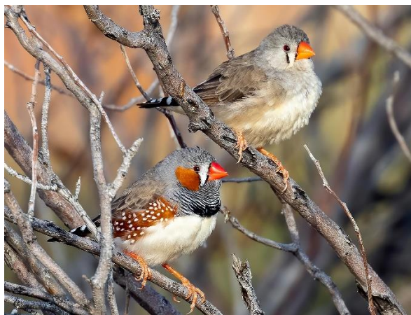
Zebra Finch (Graham Donaldson)