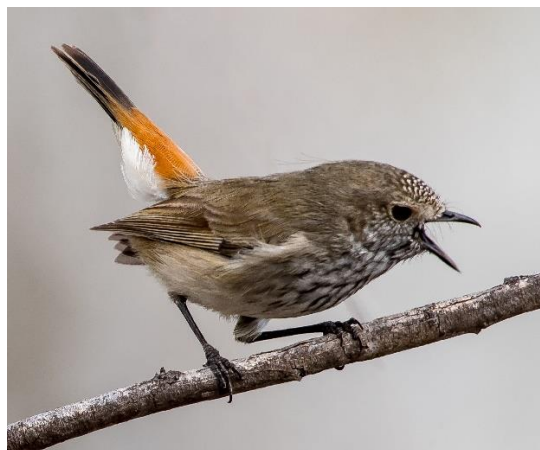
Inland Thornbill (Ross Monks)