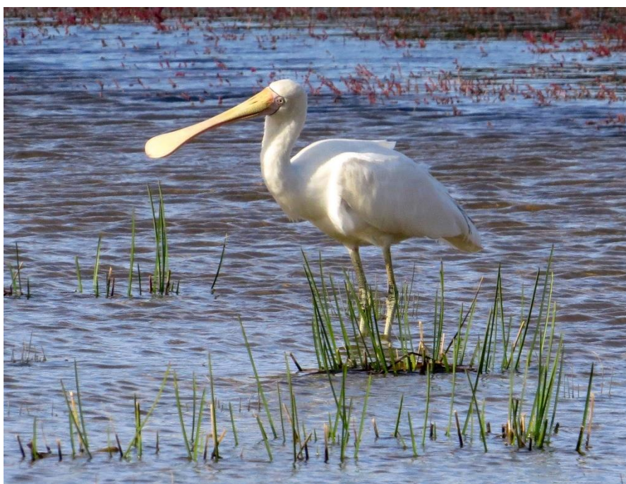
Yellow-billed Spoonbill (Vince Bugeja)