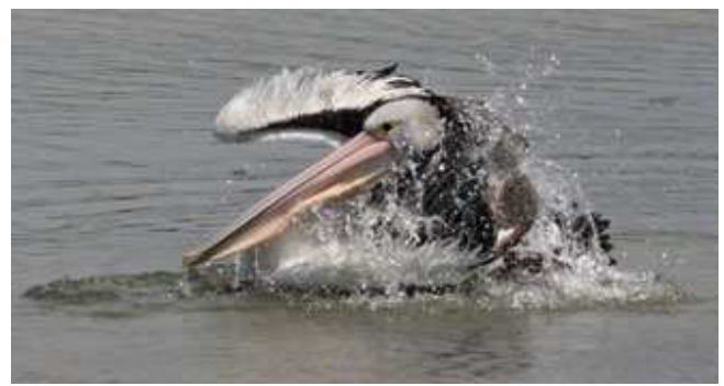
Bathing is important.

Pelicans almost always manage to look wellgroomed, and, as with all birds, feather care is very important, though it is complicated for a bird with large feet and an enormous bill.