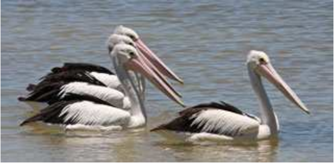
They are majestic when they paddle along, powered effortlessly by their enormous feet.

Australians Pelicans ( Pelecanus conspicillatus ) are one of the first birds we learn to identify as children. They are a common sight on rivers, lakes, beaches and jetties throughout Australia.