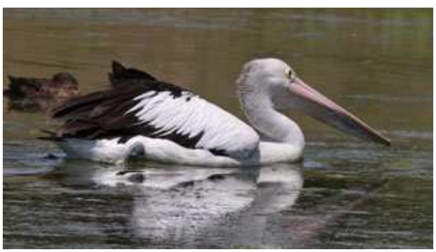
Pelicans hunt by swimming watchfully.

This bill stretching is quite common, usually in conjunction with preening. It's quite quick, so watch closely next time you see a group of Pelicans loafing on the shore.