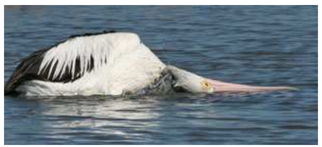
...and may be best done in the water!

Bill care is also important to keep this giant scoop flexible.