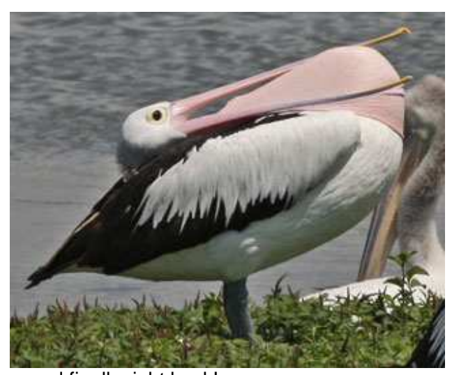
...and finally right back!

This bill stretching is quite common, usually in conjunction with preening. It's quite quick, so watch closely next time you see a group of Pelicans loafing on the shore.