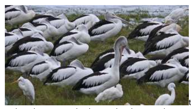
...though company is always nice, here on the Cairns waterfront including a few Egrets and a Royal Spoonbill.