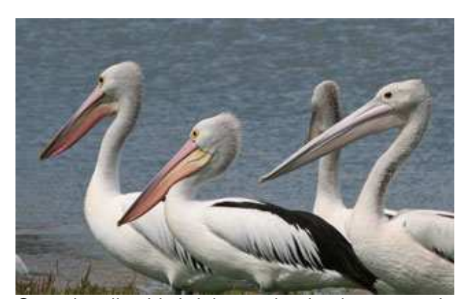
Occasionally, this brighter colouring is seen at the coast, presumably in birds about to leave for their breeding grounds. These were photographed at the Port of Brisbane Visitors' Centre lake.

When Lake Eyre and other inland lakes fill after flooding rain in the north and west, Pelicans leave the coast and move inland to breed in vast colonies. During courtship, their bills change colour.