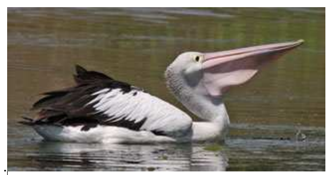
With a toss of their heads, they swallow their prey.