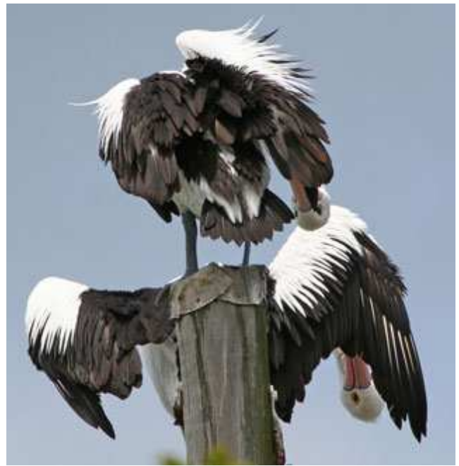
The lights on bridges and boat ramps are always popular, and this power pole at Toorbul provided a good spot for some group feather care.

They roost on any suitable structure with a good view of the water.