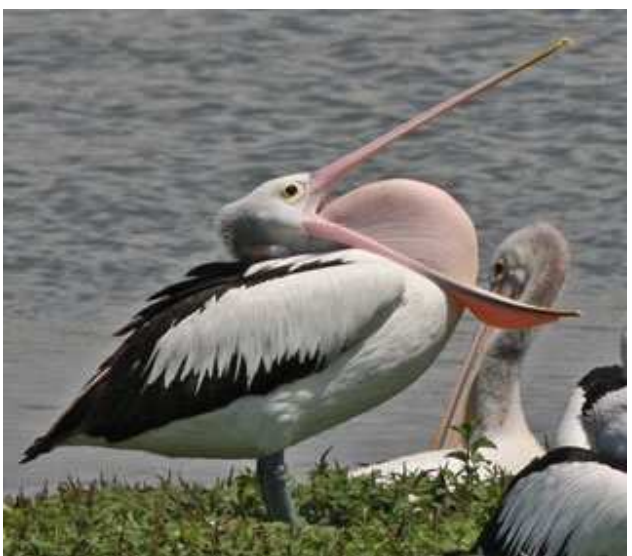
...and a little further...