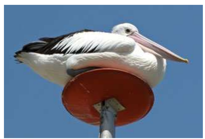
Boat masts are also popular roosts, with Pelicans if not boat owners!