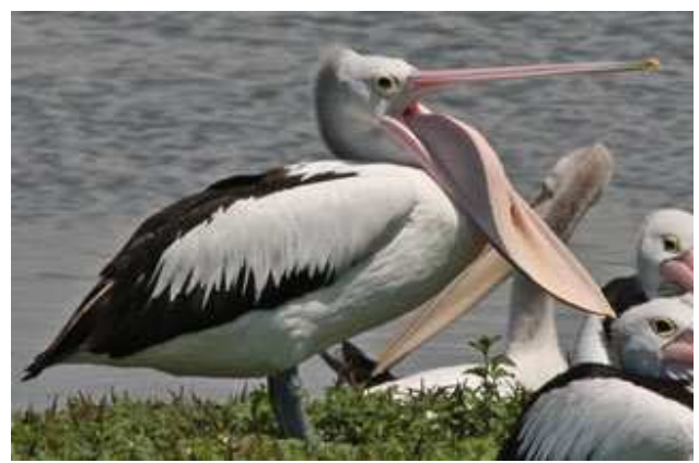
Others prefer stretching the bill over a folded neck...