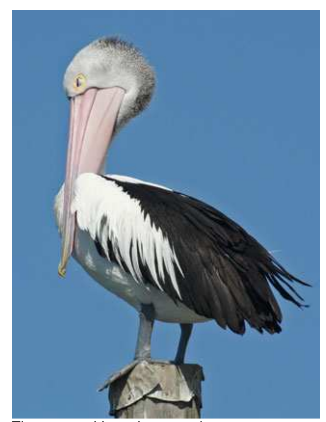
They seem able to doze anywhere...