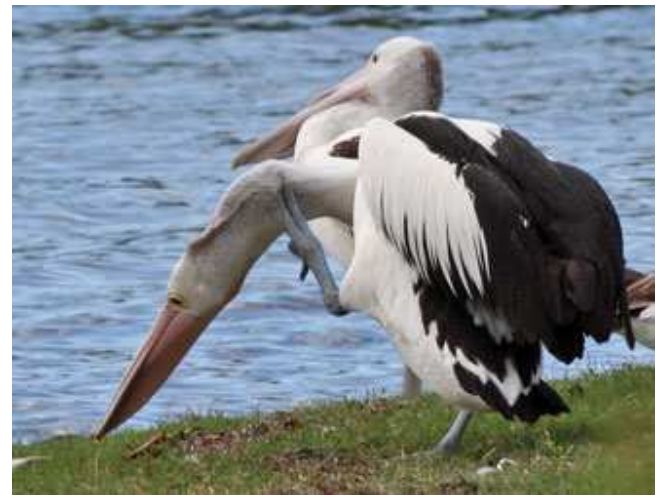
Scratching the back of the neck is pretty difficult....