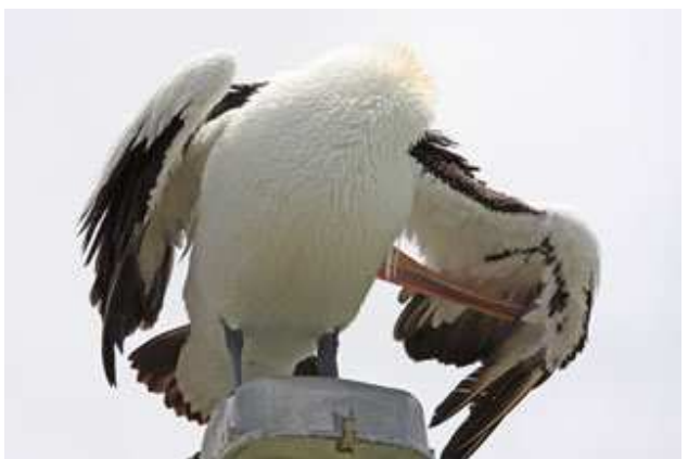
Reaching the underside of a wing requires the flexibility of a contortionist!