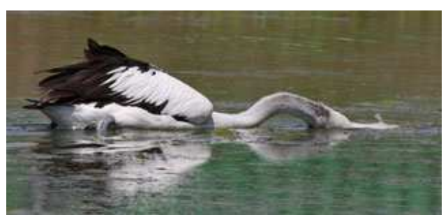
They suddenly lunge forward, extending their neck, when they see prey.