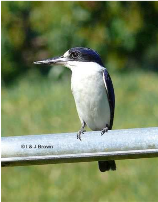
FOREST KINGFISHER Todiramphus macleayii RED-BACKED KINGFISHER Todiramphus pyrrhopygius SACRED KINGFISHER Todiramphus sanctus COLLARED KINGFISHER Todiramphus chloris