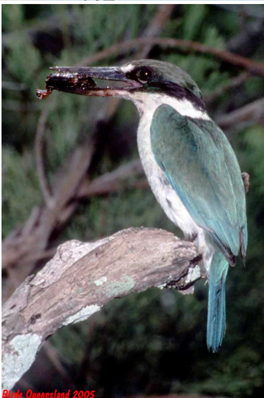
Birds Queensland 2005