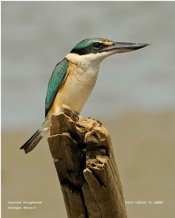
Sacred Kingfisher Wonga Beach