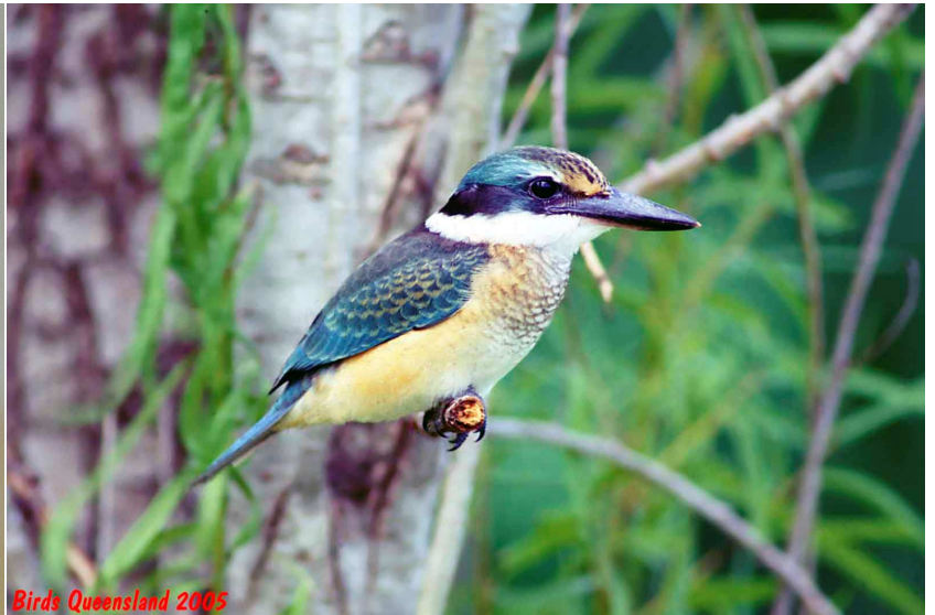
Birds Queensland 2005