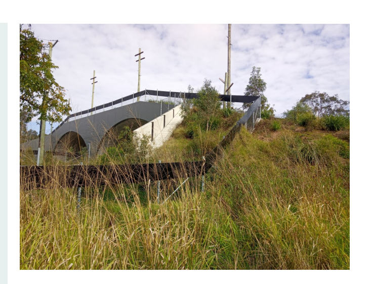
Above, Wildlife crossing