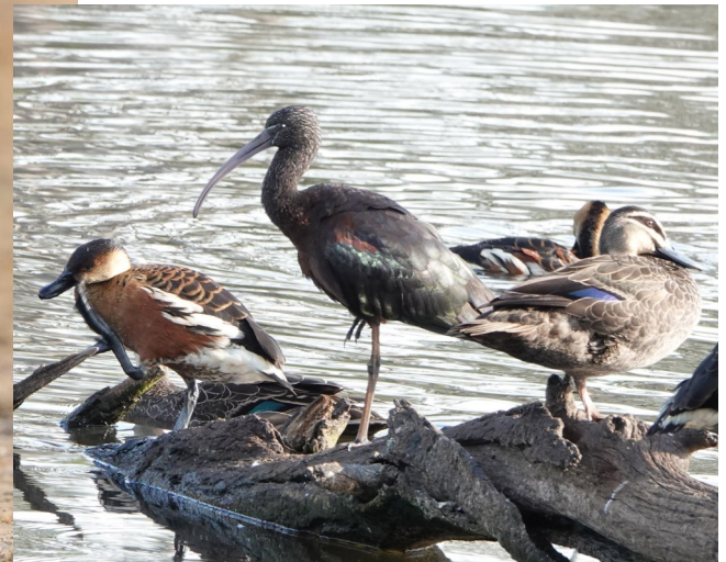
Below, Mixed flock of water birds