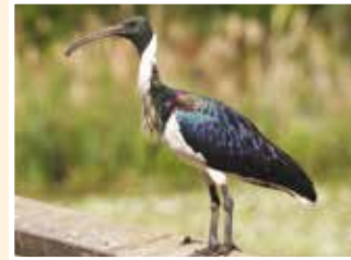
17. Straw-necked Ibis (70cm) Forages in farm and grassland. Immature birds lack "straw" on breast.