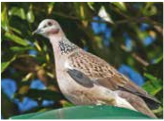
13. Spotted Dove (30cm) Introduced from Asia. Common about town.