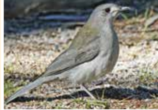
61. Grey Shrikethrush (24cm) Large eye, heavy bill. Melodious calls.