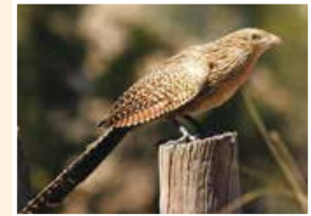
44. Pheasant Coucal (60cm) Long-tailed ground cuckoo. Raises its own young. Loud descending call.