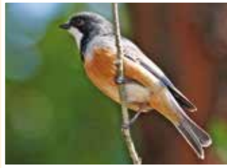
77. Rufous Whistler (17cm) Female has streaked front. Forages in open woodland. Common.