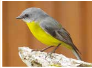
78. Eastern Yellow Robin (15cm) Inquisitive and colourful. Clings to tree trunks to scan ground.