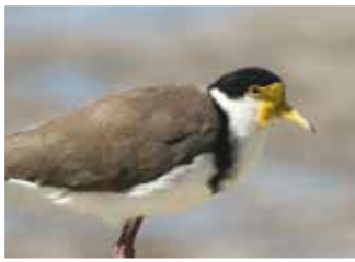
30. Masked Lapwing (36cm) Frequents open grassland and shores. Calls in flight often at night.