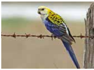
34. Pale-headed Rosella (30cm) Quiet birds found in pairs or small groups. Seed-eaters.