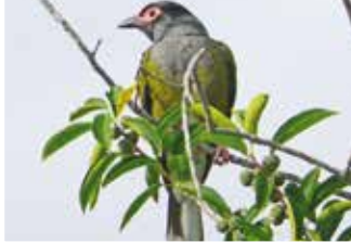
58. Australasian Figbird (29cm) Eats figs and fruit. Mostly in small flocks. Females less coloured.