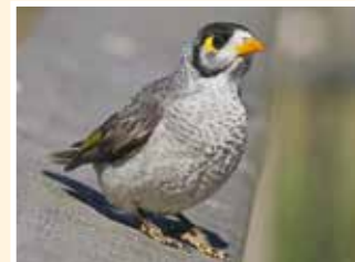
55. Noisy Miner (25cm) Communal nesting and breeding honeyeater. Territorially aggressive.