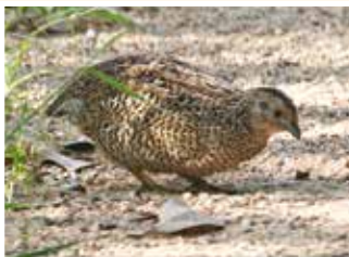
52. Brown Quail (20cm) Small, inconspicuous ground dweller. Mostly in family groups.