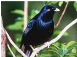
45. Satin Bowerbird (30cm) Rainforest. Males build bowers, females nests. Females brown/green.