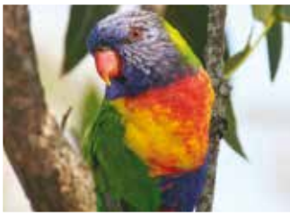
33. Rainbow Lorikeet (29cm) Common in flocks around towns. Special tongue licks nectar from flowers.