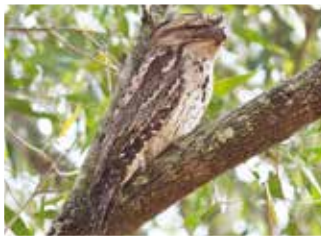
40. Tawny Frogmouth (42cm) Perches in trees during daylight. Well camouflaged. Not an owl.