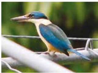
46. Sacred Kingfisher (22cm) Perches in the open looking for prey, near water or mangroves.