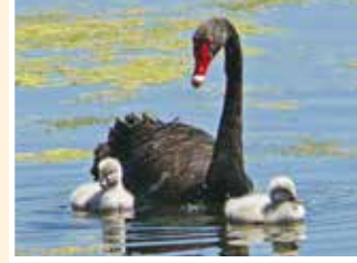
5. Black Swan (1.2m) Unique to Australia. Shows white under wings in flight. Cygnets are silver-grey.