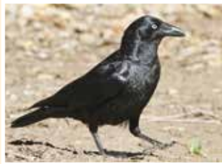
65. Torresian Crow (51cm) Common in Queensland. Scavenger, often soaks food in water.