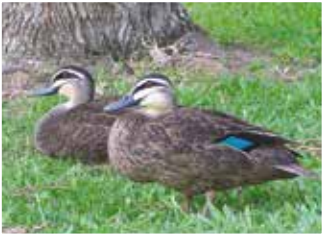
7. Pacific Black Duck (55cm) Common dabbling duck of swamps, small dams and estuaries.