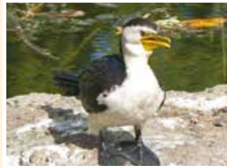
16. Little Pied Cormorant (62cm) Dives to fish. Roosts communally. Dries its wings.