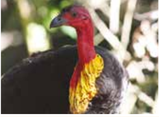
1. Australian Brushturkey (65cm) Ground dweller, roosts in trees. Male builds a mound to incubate eggs.