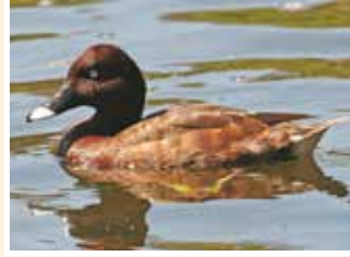
4. Hardhead (48cm) A diving duck. Male has white eyes, female brown.