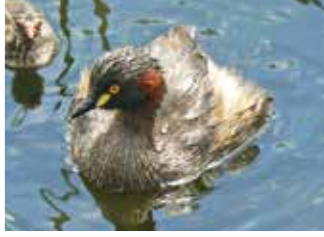
2. Australasian Grebe (24cm) Dives for fish, crustaceans and insects in fresh-water ponds and lakes.