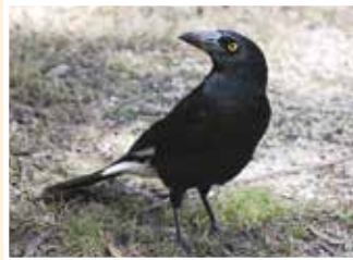
66. Pied Currawong (46cm) Widely distributed. Eats insects, small reptiles and birds, carrion, berries.