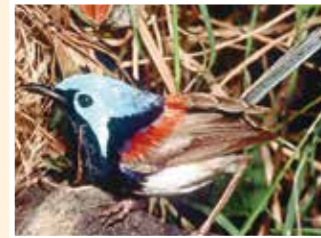
43. Variegated Fairywren (13cm) Frequents tall grass, shrubs and thick etc. Females and young brown.