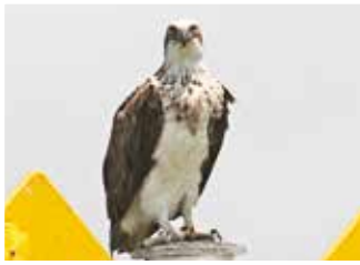
32. Osprey (60cm) Lives near the coast. Carries fish in its talons to roost or nest.

Birds Queensland is a non-profit organization, which promotes the appreciation, conservation and scientific study of birds.