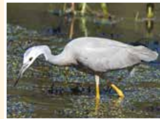
23. White-faced Heron (68cm) Hunts by waiting for patiently for prey in fresh or salt wetlands.