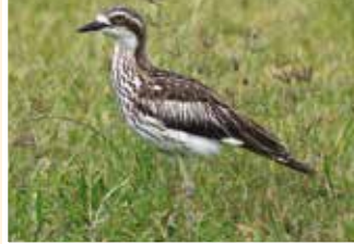
59. Bush Stone-Curlew (58cm) Frequents grasslands, parks, golf courses. Ground nesting.