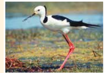
24. Pied Stilt (36cm) Common on still coastal and inland waters. Breeds locally.