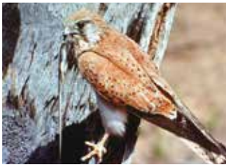
31. Nankeen Kestrel (33cm) Soars and hovers over grassland searching for food.