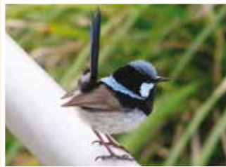
47. Superb Fairywren (14cm) Frequents tall grass, shrubs and thick etc. Females and young brown.