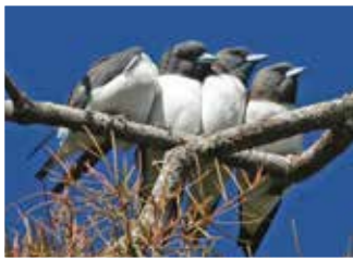
64. White-breasted Woodswallow (17cm) Catches insects in the air. Perches on power lines, high branches.