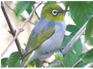
75. Silvewye (11cm) Small flocks, always moving and calling to keep in contact.