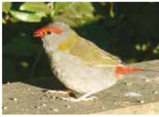
76. Red-browed Finch (11cm) Eats grass seeds. Forages in native grasses, low shrubs near water.