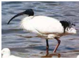
21. Australian White Ibis (70cm) Feeds on insects and small creatures, scavenges. Common in cities.