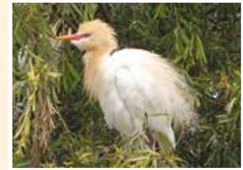
18. Eastern Cattle Egret (50cm) Orange-brown head - neck when breeding. Self introduced.