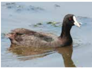
25. Eurasian Coot (37cm) White bill/forehead shield. Swims, often in huge flocks. Dives for plant food.