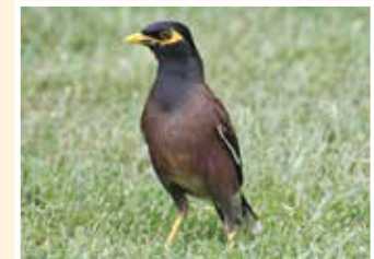
56. Common Myna (24cm) Introduced from Asia. Uses tree hollows needed by native birds.