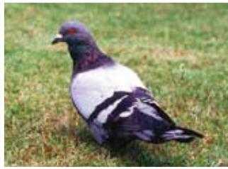
15. Rock Dove (35cm) Introduced from Europe. Ancestor to homing and fancy pigeons.