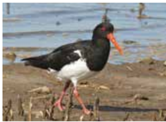
20. Pied Oystercatcher (47cm) Conspicuous shorebird. Opens oysters and shells.