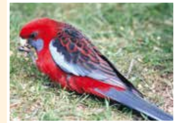
38. Crimson Rosella (35cm) Birds of higher bushland. Immature birds are greener.