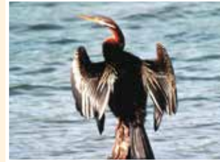
11. Australasian Darter (90cm) Dives, stabs fish with stiletto bill. Spreads wings to dry.