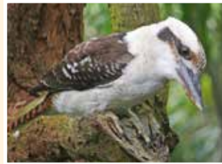
42. Laughing Kookaburra (45cm) Largest kingfisher. Nests in termites' nests in trees.