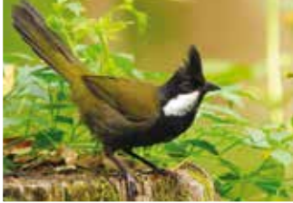
57. Eastern Whipbird (28cm) Secretive with loud calls. Male starts call – female completes it.