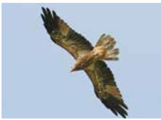
27. Whistling Kite (55cm) Distinctive white "M" underwing markings. Soars over grasslands and sea-shores.