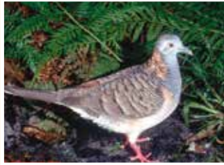
9. Bar-shouldered Dove (28cm) Inconspicuous, ground feeder. Builds very flimsy nests.