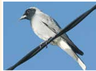
68. Black-faced Cuckooshrike. (33cm) Undulating flight. Often on wires and antennae.