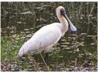
19. Royal Spoonbill (77cm) Sweeps black bill from side to side in shallow water to find food.