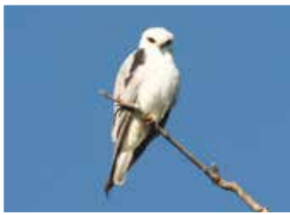
28. Black-shouldered Kite (36cm) Small hovering kite. Eats insects and small animals.