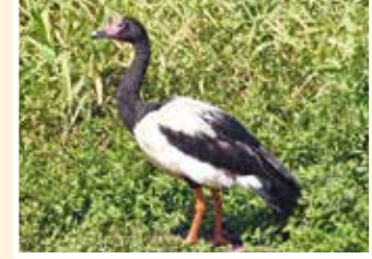
6. Magpie Goose (84cm) Feeds on roots, tubers in swamps and grassland, at times in huge flocks.