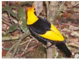
41. Regent Bowerbird (32cm) Male shown - females - streaked brown. Males build bower.