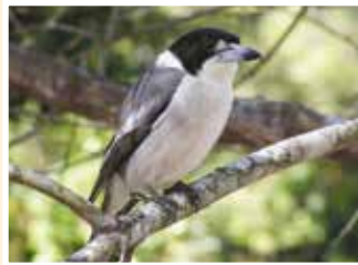
67. Grey Butcherbird (27cm) Hunts small animals, grubs and nestlings. Musical song.