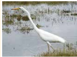
22. Great Egret (90cm) Australia's largest egret. Neck longer than body, sometimes kinked.