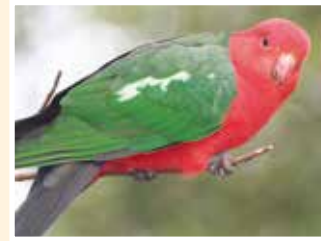
37. Australian King Parrot (42cm) Male shown - female has green head and chest, red belly.