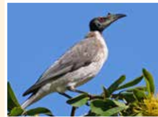
49. Noisy Friarbird (33cm) Honeyeater. Bare skin on head and knob on bill are distinctive.