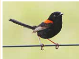
48. Red-backed Fairywren (11cm) Frequents tall grass, shrubs and thick etc. Females and young brown.