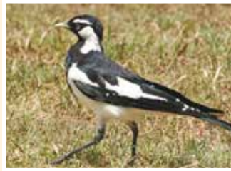
72. Magpie-lark (28cm) Often on short grass hunting grubs. Builds mud nests. "PeeWee".