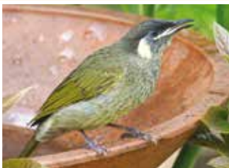
51. Lewin's Honeyeater (20cm) Frequents wetter bushland. Noisy "machine-gun" call. Yellow ear patch.