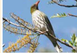
62. Olive-backed Oriole (27cm) Musical call. Eats fruits and figs. Adults have pinkish bill.