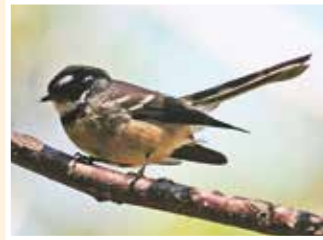
74. Grey Fantail (15cm) Never stops moving, fanning and flicking tail, chasing insects. Widely spread.