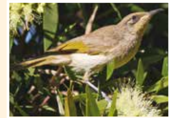
50. Brown Honeyeater (13cm) Noisy, all brown except for small yellow dot behind eye.