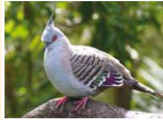
10. Crested Pigeon (32cm) A native of the inland, now common in towns. Wings noisy when flying.