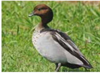
8. Maned Duck (47cm) Feeds in water and on grasslands. Nests in tree hollows.