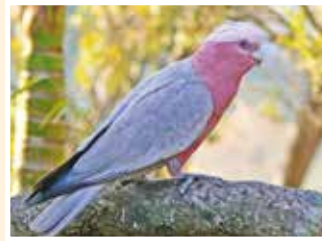
36. Galah (36cm) Widespread. Ground feeder, sometimes in huge flocks. Male has brown eye, female red.