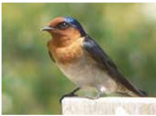
63. Welcome Swallow (15cm) Catches insects on the wing. Builds mud nests. Forked tail.