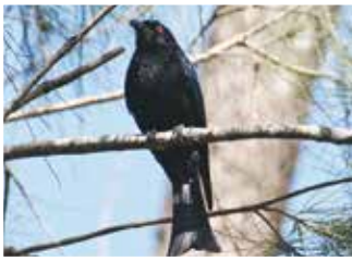
69. Spangled Drongo (31cm) Distinctive glossy plumage, red eye and "fish tail". Aerial acrobat and mimic.