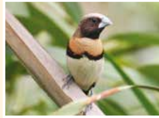
80. Chestnut-breasted Mannikin (12cm) (Finch) Eats grass seeds. Forages in grasses and low shrubs.