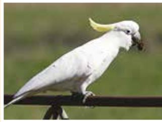
35. Sulphur-crested Cockatoo (48cm) Inland bird that moved to the coast. Forages on the ground.