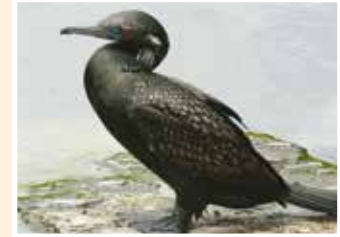
12. Little Black Cormorant (62cm) Dives to fish. Roosts communally, often fishes in large flocks. Dries its wings.