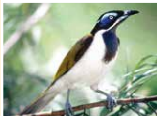
53. Blue-faced Honeyeater (31cm) Adults have bare blue skin around eye, young have green.