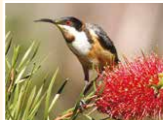
54. Eastern Spinebill (15cm) Extracts nectar with its long fine bill. Coastal and mountain habitats.