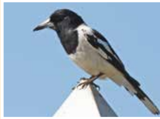
71. Pied Butcherbird (34cm) Feeds on animals, insects and nestlings. Good mimic. Black "bib".