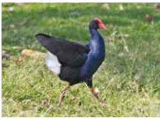
29. Australian Swamphen (46cm) Feeds in reeds and grasslands. Constantly flicks tail. Red forehead shield and bill.