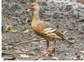
3. Plumed Whistling Duck (55cm) Feeds on grasses and seeds. Often in large flocks near ponds, dams.