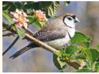
79. Double-barred Finch (10cm) Eats grass seed. Forages in grass and low shrubs. Common.