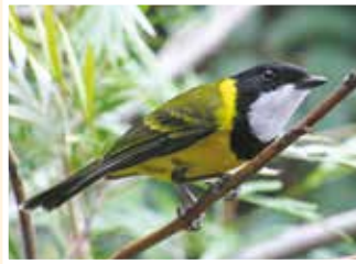
73. Golden Whistler (17cm) Male coloured - female dull, lemon-washed grey. Forages in wet forest.