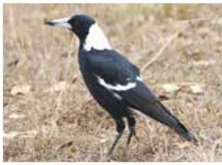
70. Australian Magpie (42cm) Open country. Eats insects and beetles. Loves short grass, lawns.