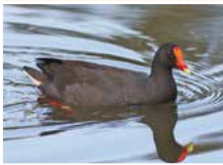
26. Dusky Moorhen (37cm) Red forehead shield with yellow tip. Swims, searches for food near fresh water.