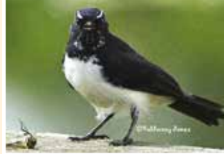
60. Willie Wagtail (19cm) Common fantail, always moving. Watch the white eyebrow.