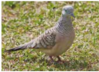
14. Peaceful Dove (20cm) Bush dove (pigeon). Feeds on the ground. Loud musical call.