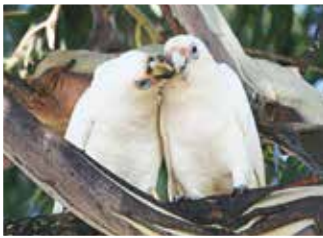
39. Little Corella (37cm) Ground feeder, sometimes in huge flocks. Yellowish underwing in flight.