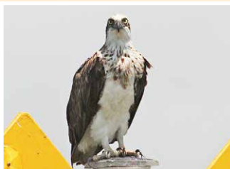
32. Osprey (60cm) Lives near the coast. Carries fish in its talons to roost or nest.