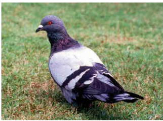
15. Rock Dove (35cm) Introduced from Europe. Ancestor to homing and fancy pigeons.