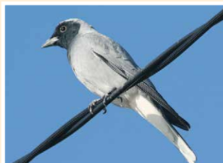
68. Black-faced Cuckooshrike. (33cm) Undulating flight. Often on wires and antennae.