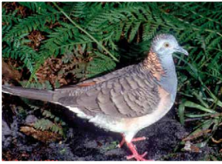
9. Bar-shouldered Dove (28cm) Inconspicuous, ground feeder. Builds very flimsy nests.