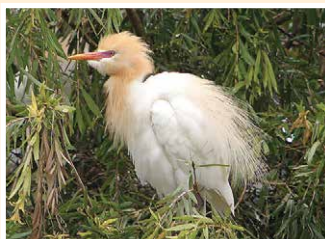
18. Eastern Cattle Egret (50cm) Orange-brown head - neck when breeding. Self introduced.