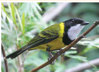
73. Golden Whistler (17cm) Male coloured - female dull, lemon-washed grey. Forages in wet forest.