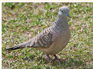
14. Peaceful Dove (20cm) Bush dove (pigeon). Feeds on the ground. Loud musical call.