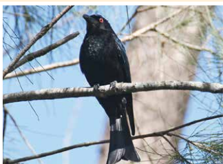
69. Spangled Drongo (31cm) Distinctive glossy plumage, red eye and "fish tail". Aerial acrobat and mimic.