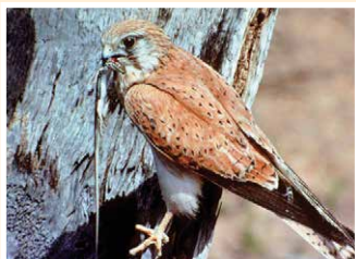
31. Nankeen Kestrel (33cm) Soars and hovers over grassland searching for food.