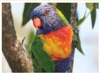
33. Rainbow Lorikeet (29cm) Common in flocks around towns. Special tongue licks nectar from flowers.