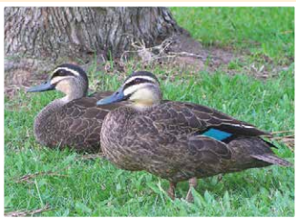
7. Pacific Black Duck (55cm) Common dabbling duck of swamps, small dams and estuaries.