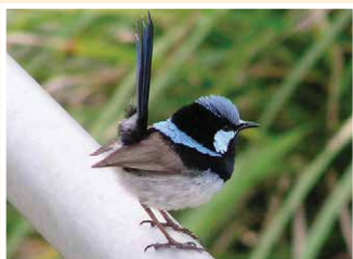
47. Superb Fairywren (14cm) Frequents tall grass, shrubs and thick-etc. Females and young brown.