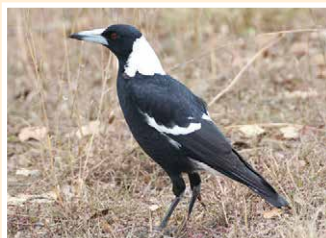
70. Australian Magpie (42cm) Open country. Eats insects and beetles. Loves short grass, lawns.