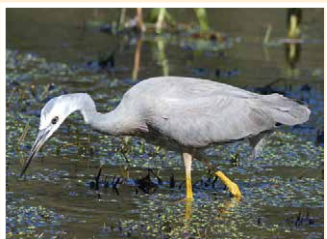
23. White-faced Heron (68cm) Hunts by waiting patiently for prey in fresh or salt wetlands.