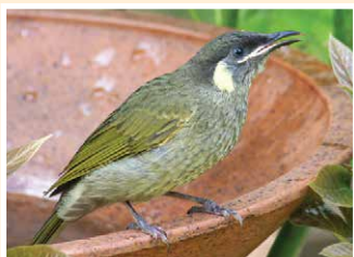
51. Lewin's Honeyeater (20cm) Frequents wetter bushland. Noisy "machine-gun" call. Yellow ear patch.