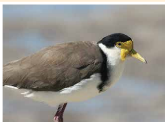
30. Masked Lapwing (36cm) Frequents open grassland and shores. Calls in flight often at night.