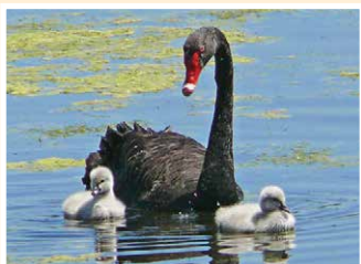
5. Black Swan (1.2m) Unique to Australia. Shows white under wings in flight. Cygnets are silver-grey.