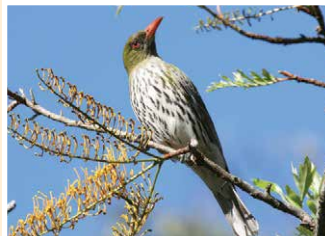
62. Olive-backed Oriole (27cm) Musical call. Eats fruits and figs. Adults have pinkish bill.