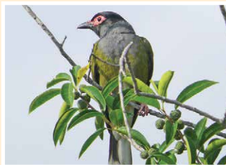
58. Australasian Figbird (29cm) Eats figs and fruit. Mostly in small flocks. Females less coloured.