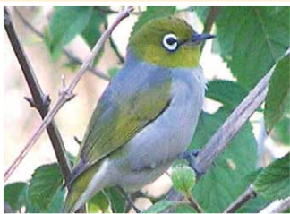
75. Silvereye (11cm) Small flocks, always moving and calling to keep in contact.