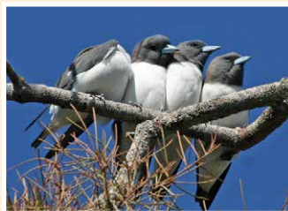
64. White-breasted Woodswallow (17cm) Catches insects in the air. Perches on power lines, high branches.