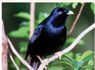
45. Satin Bowerbird (30cm) Rainforest. Males build bowers, females nests. Females brown/green.