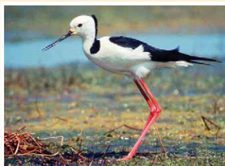
24. Pied Stilt (36cm) Common on still coastal and inland waters. Breeds locally.