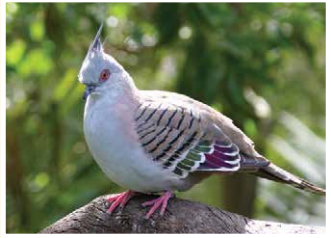
10. Crested Pigeon (32cm) A native of the inland, now common in towns. Wings noisy when flying.