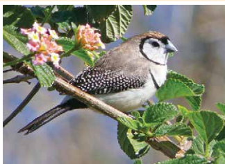
79. Double-barred Finch (10cm) Eats grass seed. Forages in grass and low shrubs. Common.