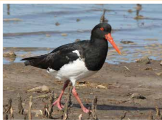
20. Pied Oystercatcher (47cm) Conspicuous shorebird. Opens oysters and shells.