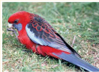
38. Crimson Rosella (35cm) Birds of higher bushland. Immature birds are greener.