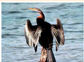
11. Australasian Darter (90cm) Dives, stabs fish with stiletto bill. Spreads wings to dry.