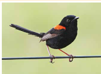
48. Red-backed Fairywren (11cm) Frequents tall grass, shrubs and thick-etc. Females and young brown.