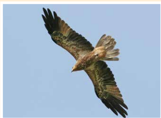
27. Whistling Kite (55cm) Distinctive white "M" underwing markings. Soars over grasslands and sea-shores.