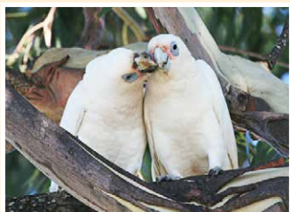
39. Little Corella (37cm) Ground feeder, sometimes in huge flocks. Yellowish underwing in flight.