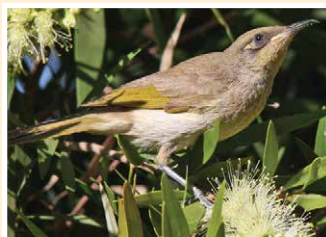
50. Brown Honeyeater (13cm) Noisy, all brown except for small yellow dot behind eye.