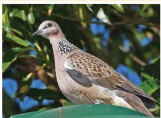
13. Spotted Dove (30cm) Introduced from Asia. Common about town.