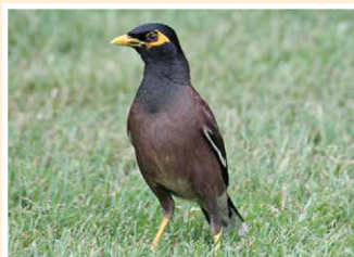
56. Common Myna (24cm) Introduced from Asia. Uses tree hollows needed by native birds.