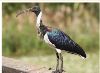
17. Straw-necked Ibis (70cm) Forages in farm and grassland. Immature birds lack "straw" on breast.