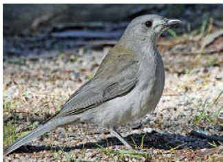
61. Grey Shrikethrush (24cm) Large eye, heavy bill. Melodious calls.