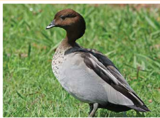
8. Maned Duck (47cm) Feeds in water and on grasslands. Nests in tree hollows.