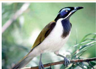
53. Blue-faced Honeyeater (31cm) Adults have bare blue skin around eye, young have green.