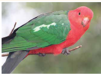
37. Australian King Parrot (42cm) Male shown - female has green head and chest, red belly.