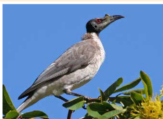
49. Noisy Friarbird (33cm) Honeyeater. Bare skin on head and knob on bill are distinctive.