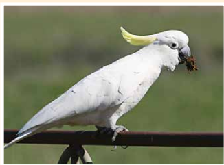
35. Sulphur-crested Cockatoo (48cm) Inland bird that moved to the coast. Forages on the ground.