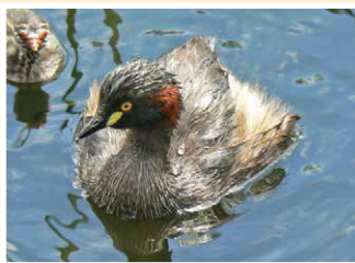
2. Australasian Grebe (24cm) Dives for fish, crustaceans and insects in fresh-water ponds and lakes.