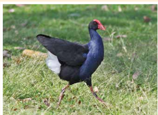
29. Australian Swamphen (46cm) Feeds in reeds and grasslands. Constantly flicks tail. Red forehead shield and bill.