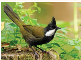
57. Eastern Whipbird (28cm) Secretive with loud calls. Male starts call – female completes it.