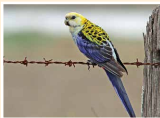
34. Pale-headed Rosella (30cm) Quiet birds found in pairs or small groups. Seed-eaters.