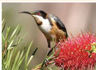
54. Eastern Spinebill (15cm) Extracts nectar with its long fine bill. Coastal and mountain habitats.