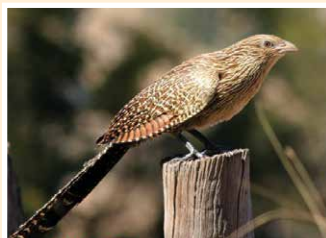
44. Pheasant Coucal (60cm) Long-tailed ground cuckoo. Raises its own young. Loud descending call.