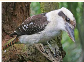
42. Laughing Kookaburra (45cm) Largest kingfisher. Nests in termites' nests in trees.