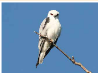
28. Black-shouldered Kite (36cm) Small hovering kite. Eats insects and small animals.