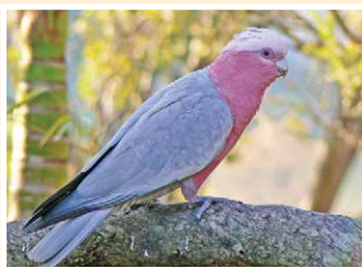
36. Galah (36cm) Widespread. Ground feeder, sometimes in huge flocks. Male has brown eye, female red.