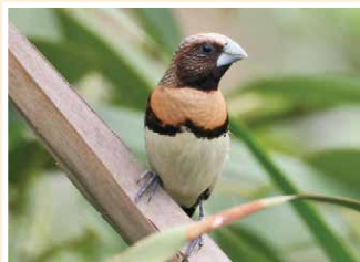
80. Chestnut-breasted Mannikin (12cm) (Finch) Eats grass seeds. Forages in grasses and low shrubs.