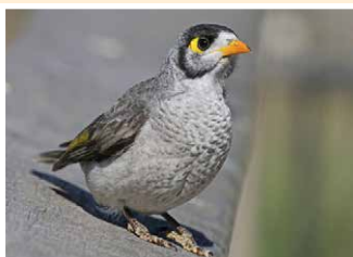
55. Noisy Miner (25cm) Communal nesting and breeding honeyeater. Territorially aggressive.