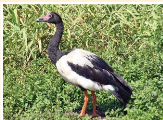
6. Magpie Goose (84cm) Feeds on roots, tubers in swamps and grassland, at times in huge flocks.