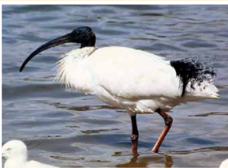
21. Australian White Ibis (70cm) Feeds on insects and small creatures, scavenges. Common in cities.