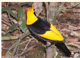
41. Regent Bowerbird (32cm) Male shown - females - streaked brown. Males build bower.