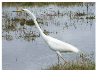
22. Great Egret (90cm) Australia's largest egret. Neck longer than body, sometimes kinked.