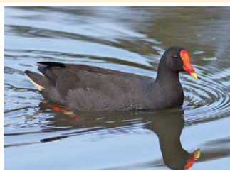
26. Dusky Moorhen (37cm) Red forehead shield with yellow tip. Swims, searches for food near fresh water.