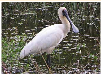
19. Royal Spoonbill (77cm) Sweeps black bill from side to side in shallow water to find food.