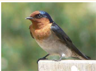
63. Welcome Swallow (15cm) Catches insects on the wing. Builds mud nests. Forked tail.