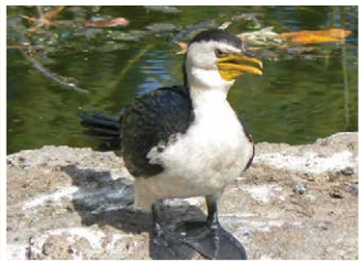
16. Little Pied Cormorant (62cm) Dives to fish. Roosts communally. Dries its wings.