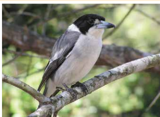
67. Grey Butcherbird (27cm) Hunts small animals, grubs and nestlings. Musical song.