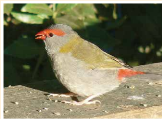
76. Red-browed Finch (11cm) Eats grass seeds. Forages in native grasses, low shrubs near water.