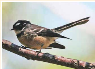
74. Grey Fantail (15cm) Never stops moving, fanning and flicking tail, chasing insects. Widely spread.