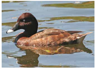
4. Hardhead (48cm) A diving duck. Male has white eyes, female brown.