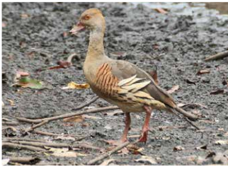
3. Plumed Whistling Duck (55cm) Feeds on grasses and seeds. Often in large flocks near ponds, dams.