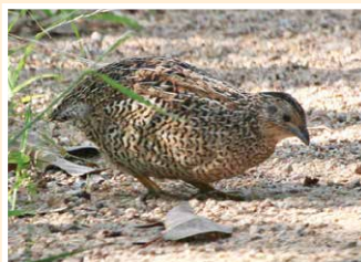
52. Brown Quail (20cm) Small, inconspicuous ground dweller. Mostly in family groups.