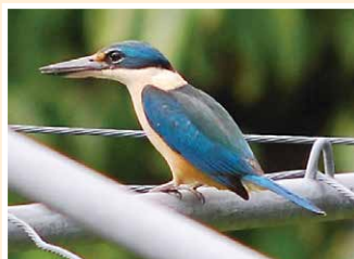
46. Sacred Kingfisher (22cm) Perches in the open looking for prey, near water or mangroves.