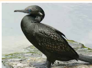
12. Little Black Cormorant (62cm) Dives to fish. Roosts communally, often fishes in large flocks. Dries its wings.