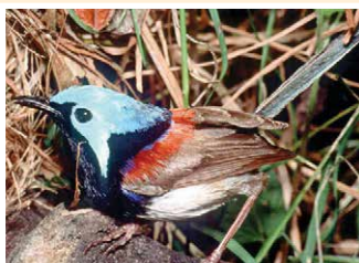
43. Variegated Fairywren (13cm) Frequents tall grass, shrubs and thick etc. Females and young brown.