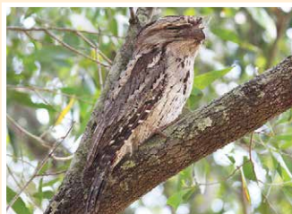
40. Tawny Frogmouth (42cm) Perches in trees during daylight. Well camouflaged. Not an owl.