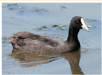
25. Eurasian Coot (37cm) White bill/forehead shield. Swims, often in huge flocks. Dives for plant food.