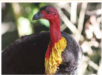
1. Australian Brushturkey (65cm) Ground dweller, roosts in trees. Male builds a mound to incubate eggs.