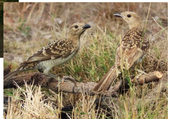
Right: Spotted Bowerbirds